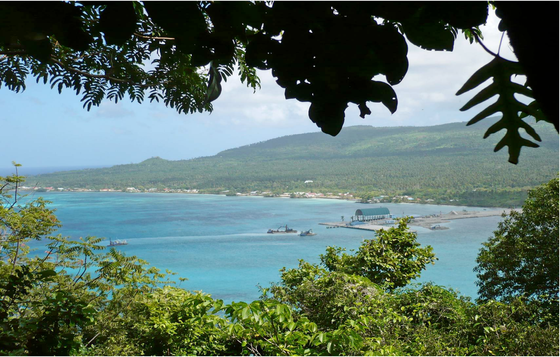
View from Namua Island, Samoa, 12 July 2009, looking at the coastal area of Upolu which was devastated by the tsunami on 29 September 2009 - Lynda.