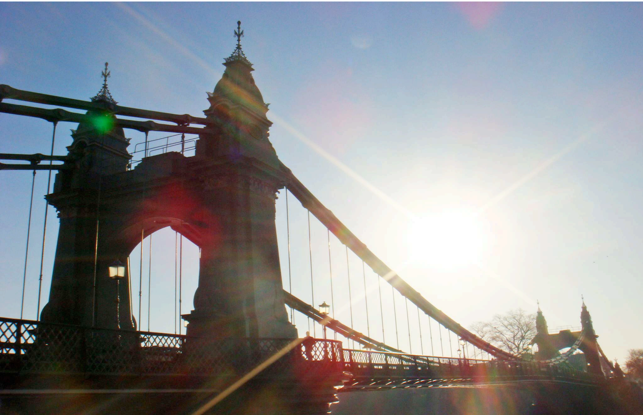
Hammersmith Bridge, Alisi in London