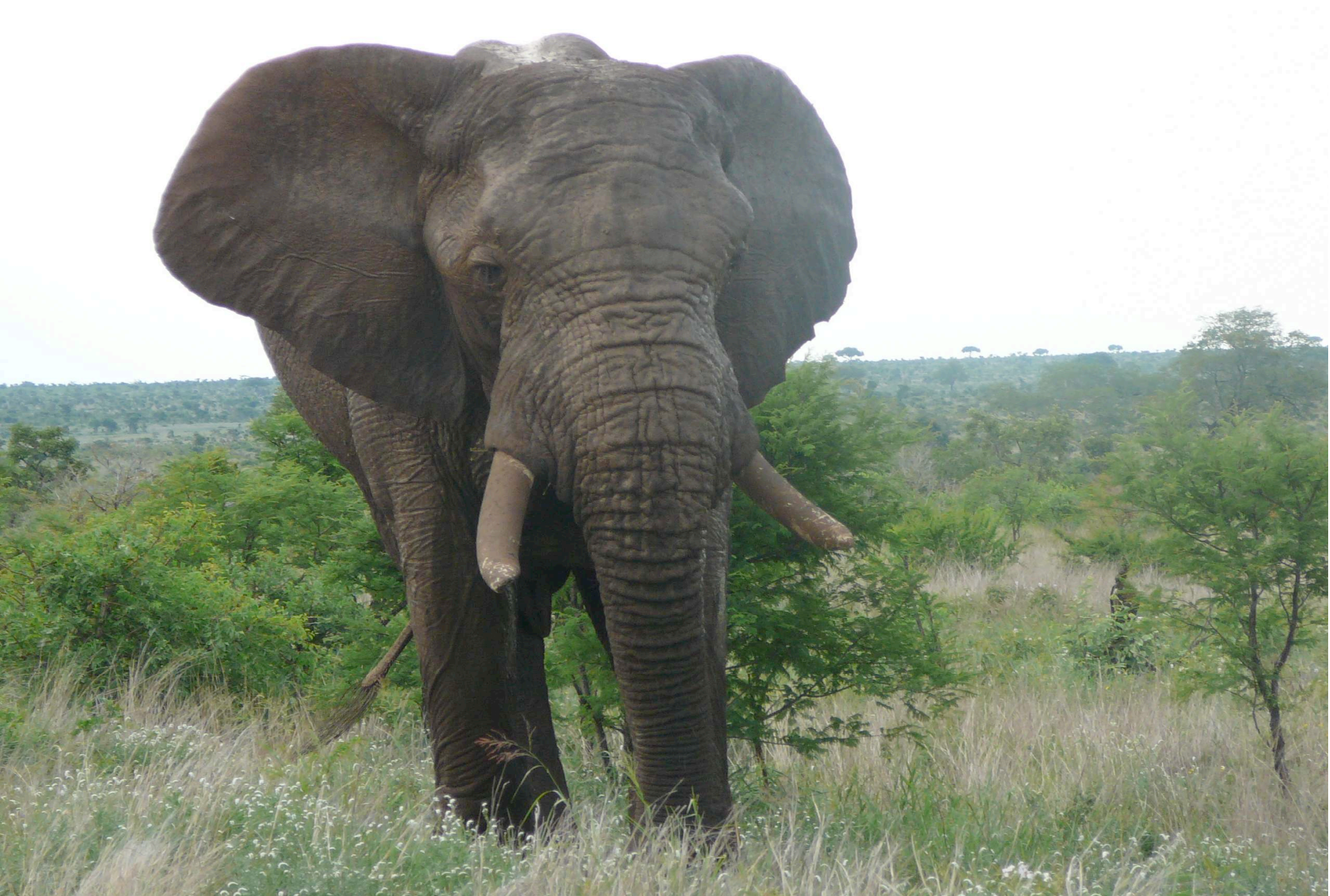
Kruger National Park, South Africa - Dugan