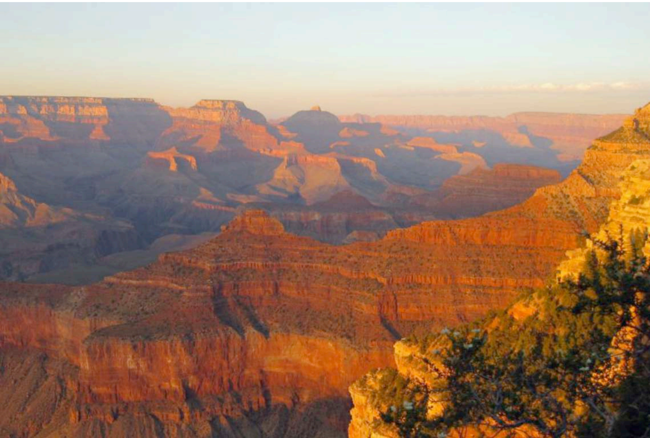
Sunset at the Grand Canyon, USA - Claire and Luke