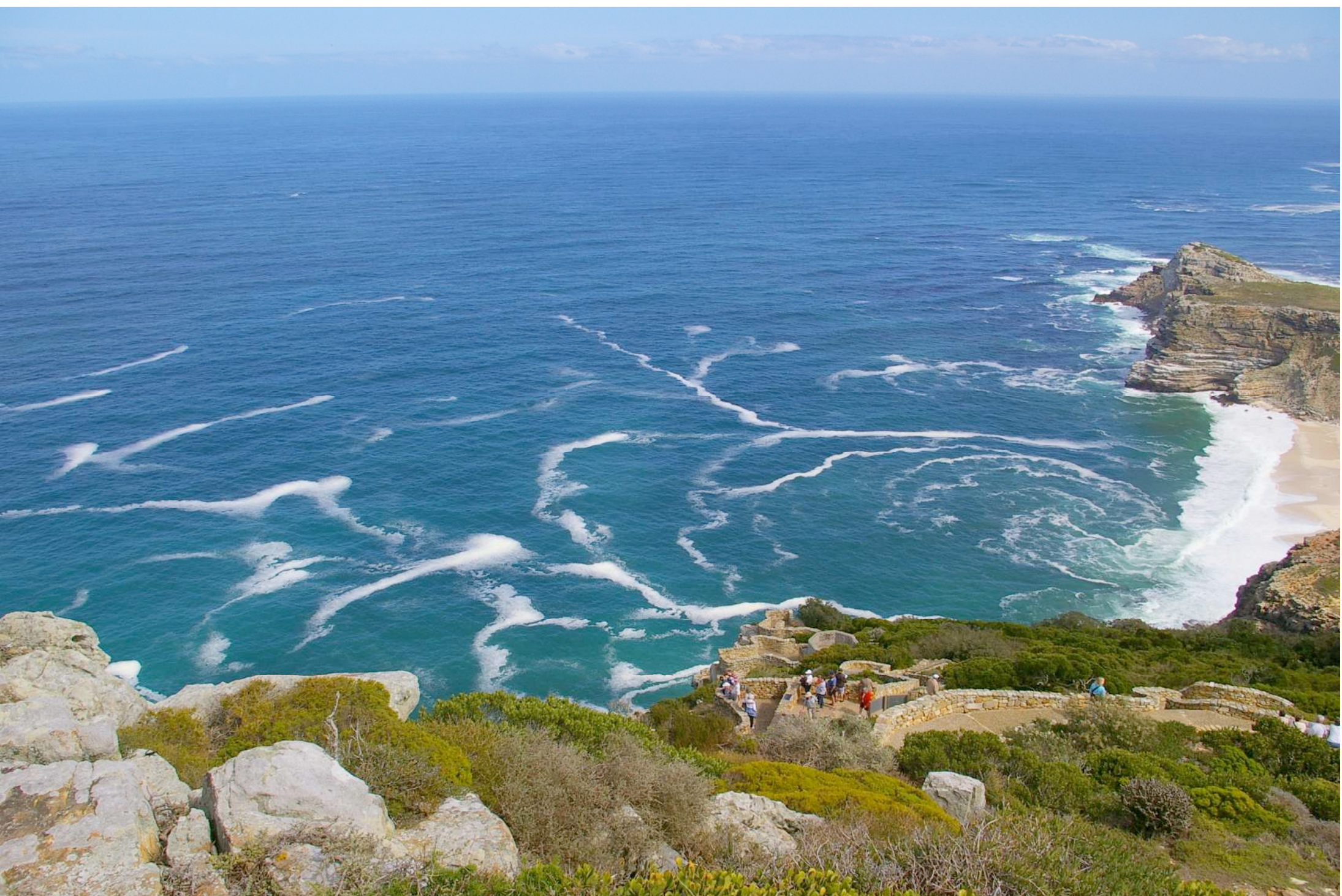
Meeting of the Atlantic and Indian Oceans, Vaughan at Cape of Good Hope