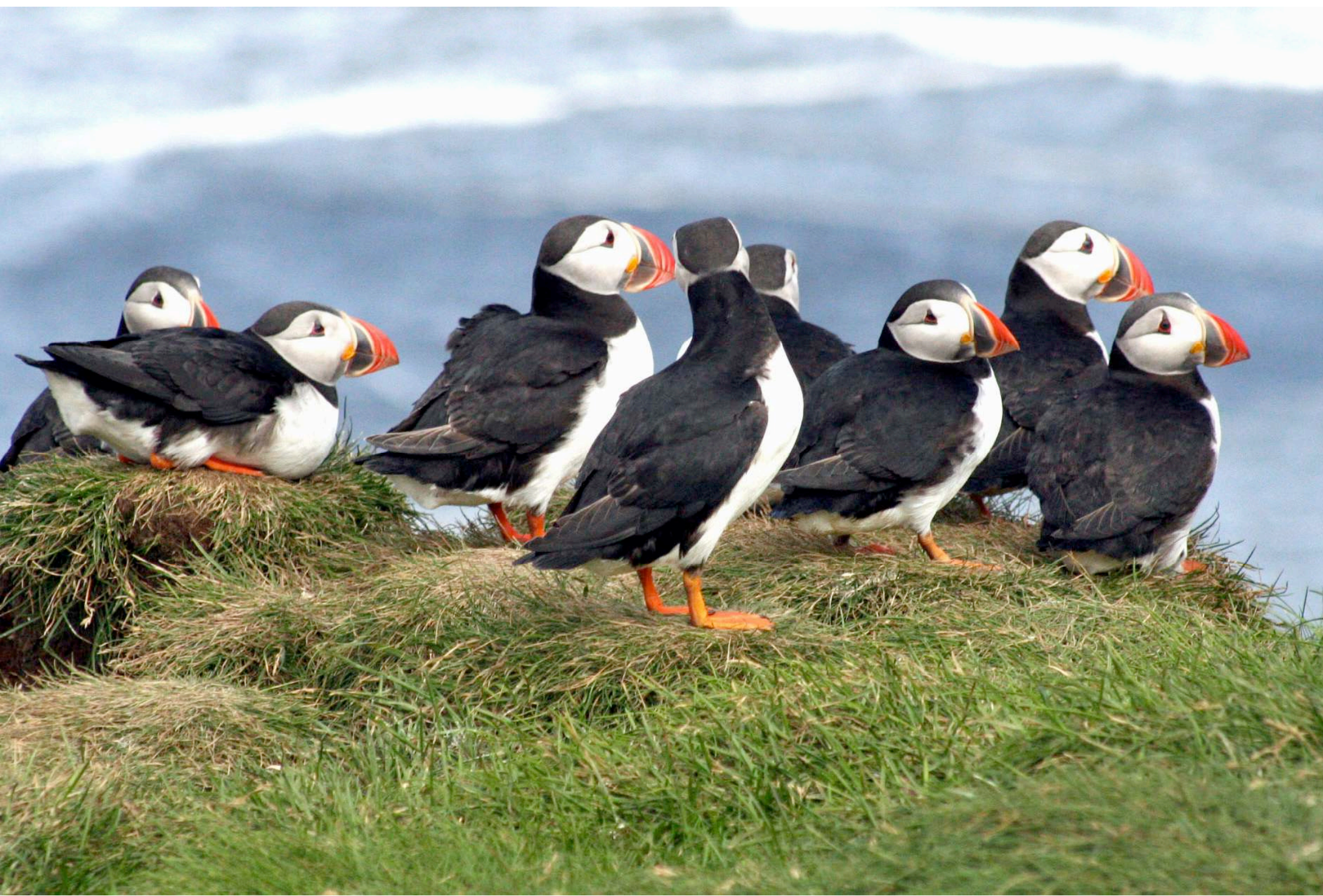
Royce and Owen visit the Puffins, Iceland