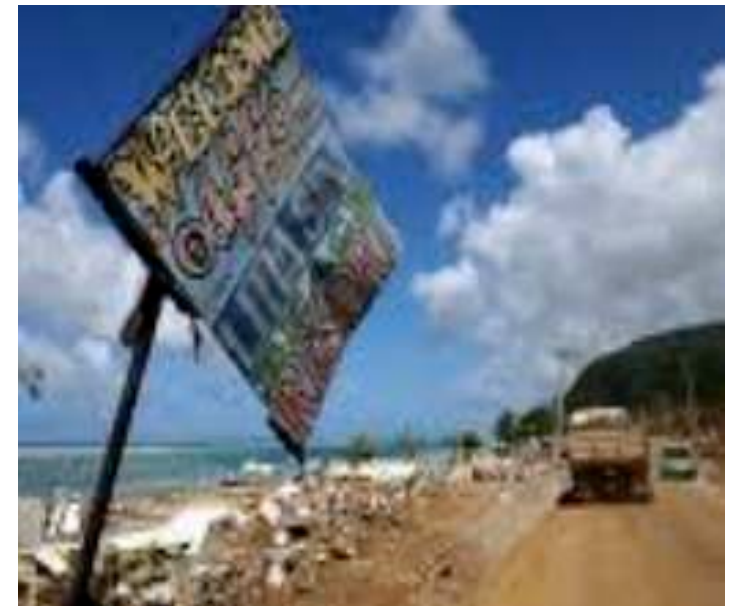
Welcome to Litia Sini - the sign is defiant.

This area was completely devastated by the October 29 tsunami, as can be seen in the photo (right). Nothing remains between the road and the sea. Many lives were lost in the sudden unforgiving wave.