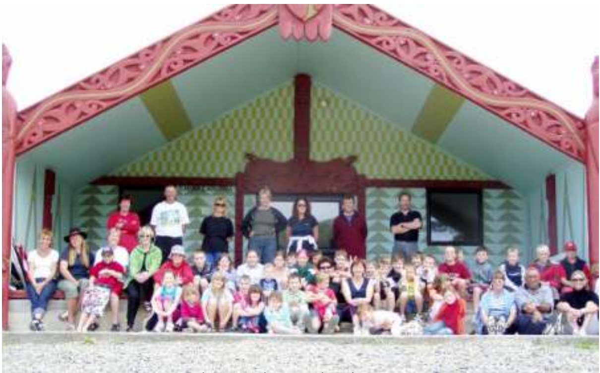
The Awahou School Party