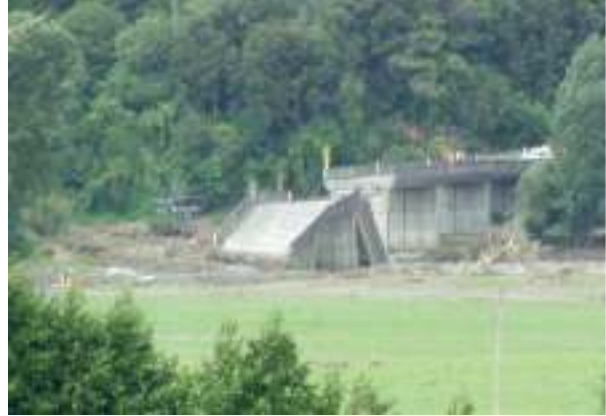
The Saddle Road Bridge was broken