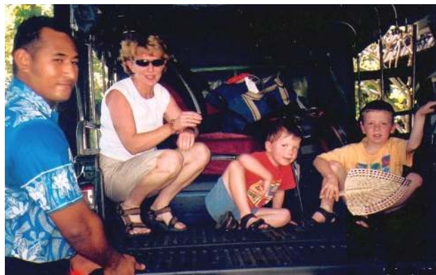
Ready to ride in the back of the rental van