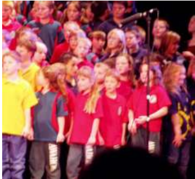
Awahou School wore red shirts