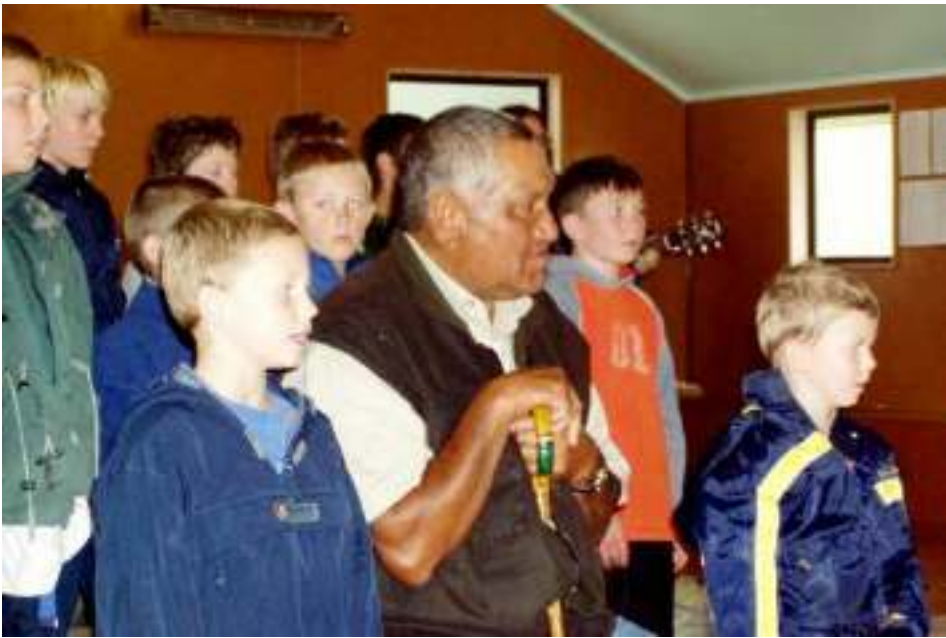
The Kaumatua was the host who looked after the visitors