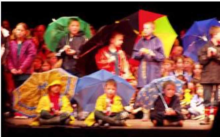
Awahou School's item "Overdose of Rain"