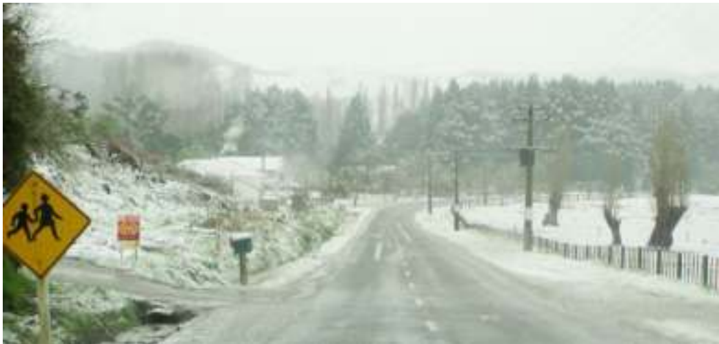
On the road