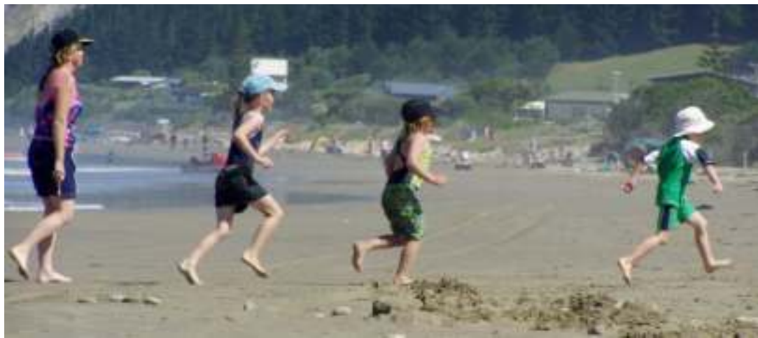
Running on the beach at Waimarama