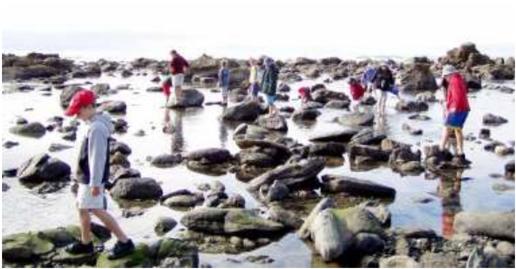
And to the beach at Akitio where there were many strange sea creatures