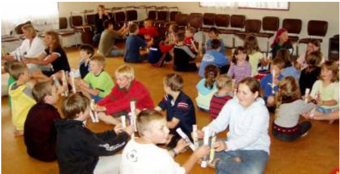
Learning a stick game