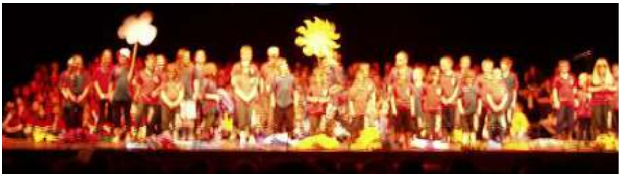
The end of the item, "I can see Clearly Now"