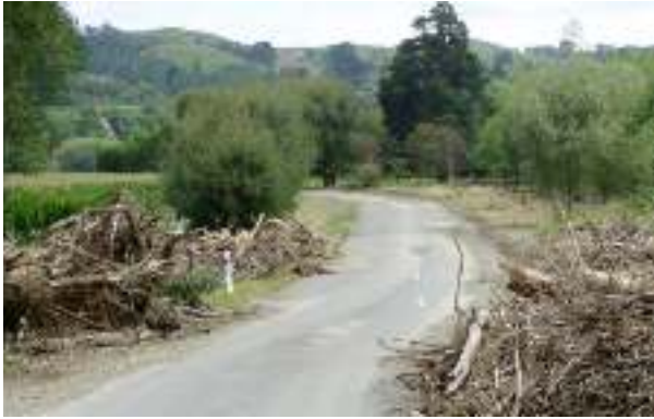
After the storm everyone went to look at the damage