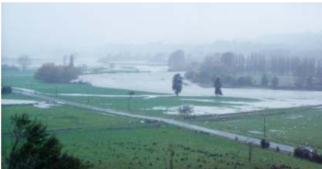
The Pohangina River breaks its banks