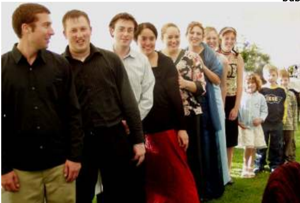
Nana asked all her grandchildren to line up in a row.