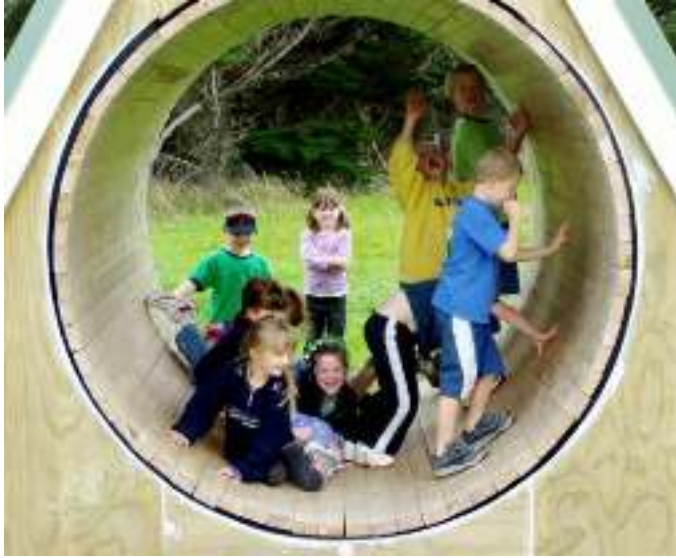
On the way to Akitio the children played in the park at Weber