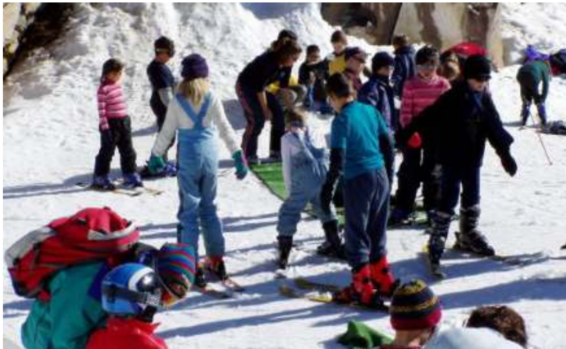
The ski lessons for beginners