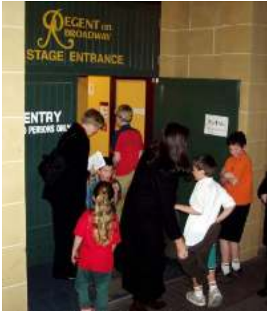
Arriving at the Stage Door

Eight country schools combined for a concert at the Regent on Broadway