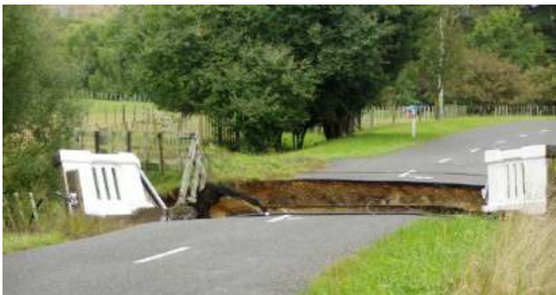
Wash-out at Pohangina. The little stream had turned into a torrent