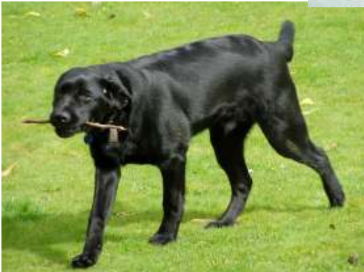
How he has grown!