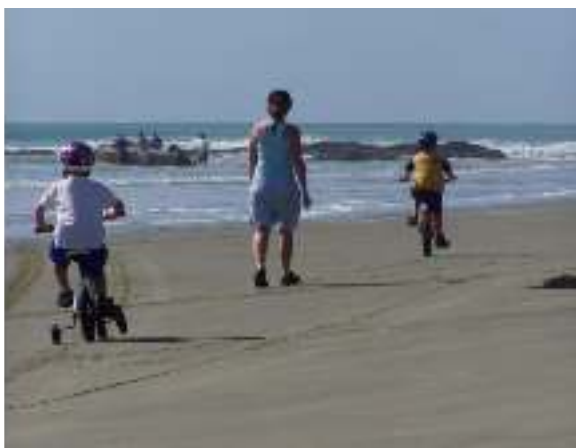
And biking, too