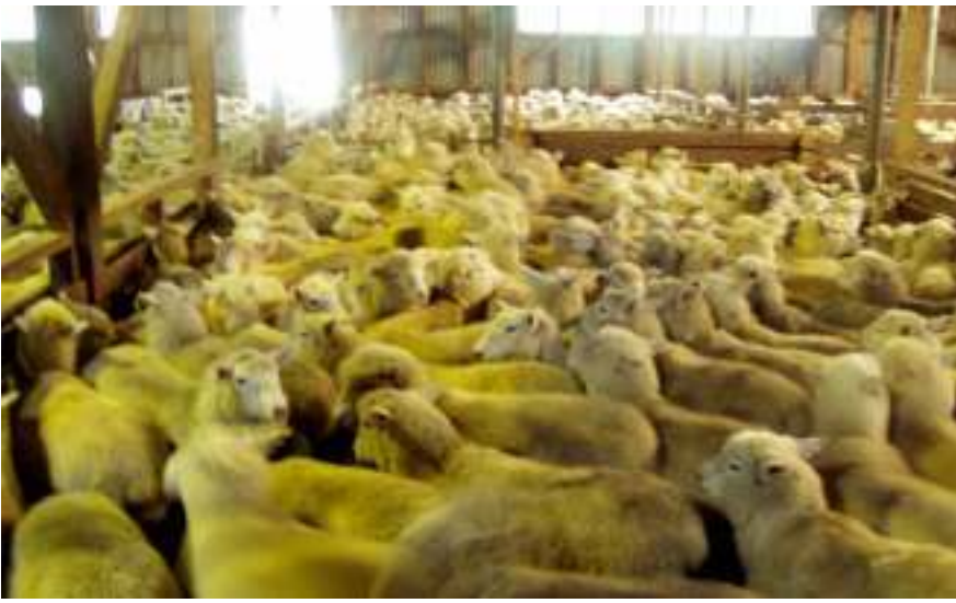
The School was taken to see a shearing shed - so many sheep!