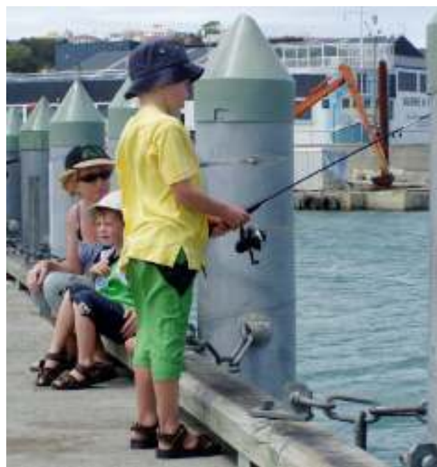
Fishing off The Port at Napier.