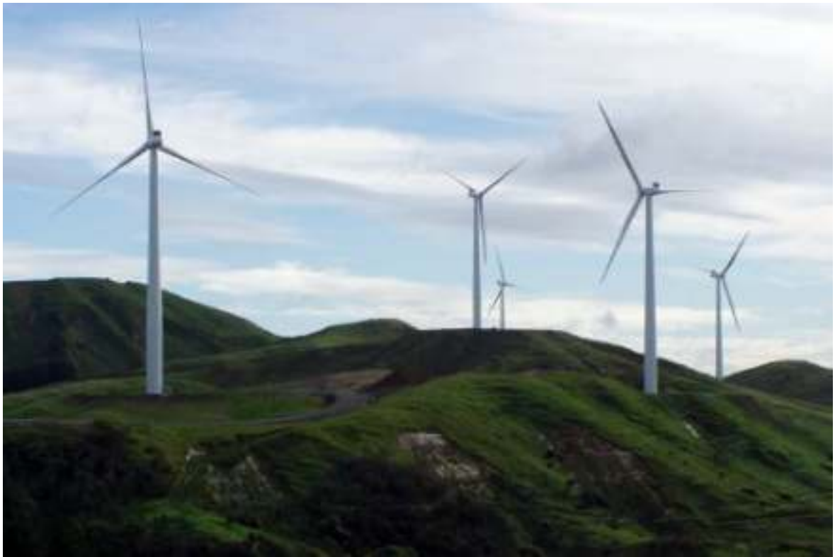
A few of the turbines at the Te Apiti Windfarm on the Saddle Road